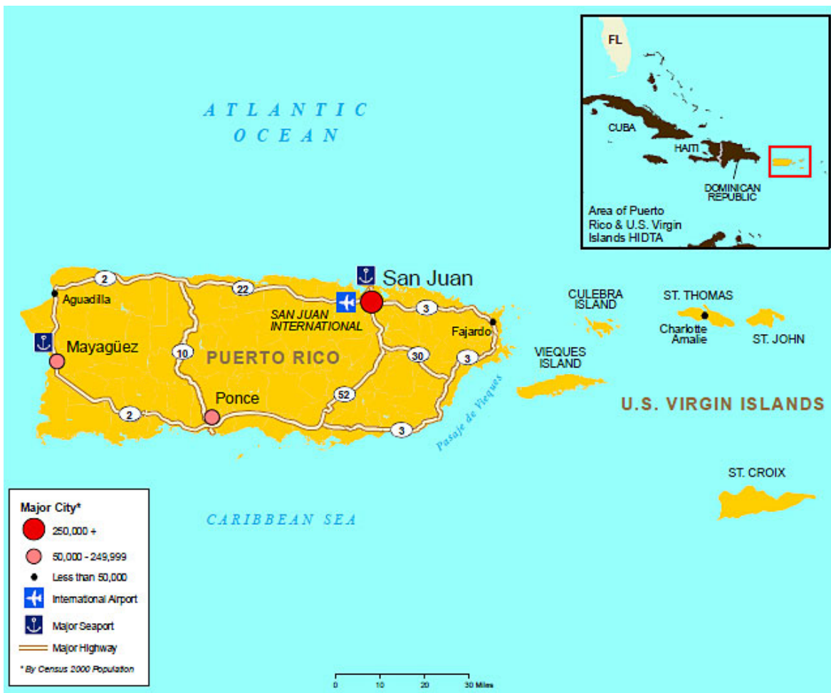
Figure 1. US Caribbean Border

pose significant challenges. Dominican and Puerto Rican TCOs are the primary wholesale and retail distributors of cocaine in the Caribbean region. Illicit trafficking is a highly fluid enterprise which generally follows the path of least resistance. The documented cocaine flow from the source zone to the United States via the Caribbean—including Puerto Rico, the Dominican Republic, and Eastern Caribbean countries—has more than doubled in the past 3 years, from 38 metric tons (MT) in 2011, to 59 MT in 2012, and 91 MT in 2013. 2 This marks the highest documented cocaine flow since 2003. Possible reasons for the increased flow are increased maritime seizures in the Western Caribbean and Eastern Pacific during the 2000’s, enhanced interagency efforts along the Southwest Border and an increased awareness of smuggling activities in the Eastern Caribbean region. An example of these interagency efforts is Operation Martillo, which is a JIATF-South led interagency surge operation with Western Hemisphere and European partners targeting illicit trafficking routes in the coastal waters along the Central American isthmus.