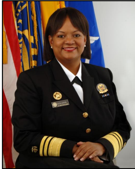
Vice Admiral Regina M. Benjamin, U.S. Surgeon General.

The Affordable Care Act recognizes prevention is an essential component of healthcare reform and makes a substantial investment in this commitment. As part of the Affordable Care Act, President Obama signed an Executive Order on June 10, 2010, creating the National Prevention, Health Promotion, and Public Health Council (the National Prevention Council), which I chair. There is also an Advisory Group on Prevention, Health Promotion, and Integrative and Public Health, made up of outside experts appointed by the President, which brings a non-Federal perspective to this effort.