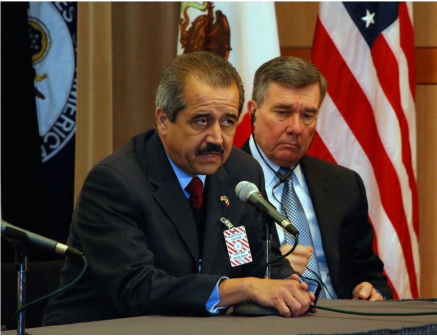
Director Gil Kerlikowske, right, listens as José Ángel Córdova, Mexico's Secretary of Health, speaks at the U.S.-Mexico Binational Drug Demand Reduction Policy Meeting, held in February at the U.S. Department of State in Washington, DC.