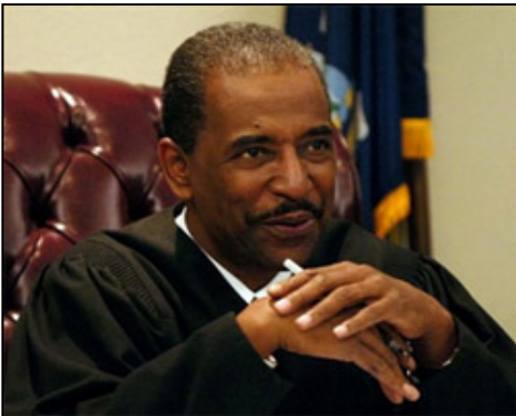
Judge Robert Russell

Immediately following the launch of the Buffalo Veterans Treatment Court, Judge Russell and his team were inundated with questions from other jurisdictions seeing similar increases in veteran involvement in the criminal justice system. Today, communities around the country are looking to Veterans Treatment Courts as a way to help justice-involved veterans with substance abuse and/or mental health issues. There are now 75 operational Veterans Treatment Courts in the United States, and dozens more are in the planning stages.