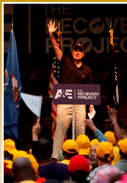
Director Kerlikowske celebrates recovery at the Recovery Rally last fall in New York City.

ONDCP will continue to promote the idea that recovery is possible. This focus on recovery will provide the Nation with a new lens through which to view addiction, as well as new policies that will sustain renewed health and wellness for those striving to remain drug free.