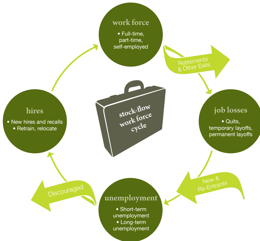
FIGURE 1. Flow of Workers through the Dynamic U.S. Labor Market

Long-term unemployment, by contrast, results when labor supply persistently exceeds labor demand in at least some regions or sectors of the economy. It can be driven by a number of factors, including inflexible wage rates, 44 technological change, 45 and foreign competition. 46 Potential causes for the nation's current unemployment troubles include the immobility of the workforce across sectors and geographic regions as the composition of labor demand shifted; long-term structural changes to the U.S. economy associated with technological advances and globalization; and the prolonged reduction in consumer demand during the recent economic recession. 47