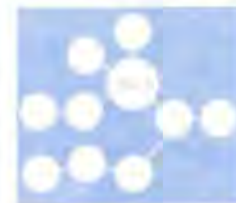
The Simple Elements of Vinyl

See www.flexvinylalliance.com for the Join Now page.