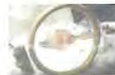
Vinyl Housed Baby Intubator