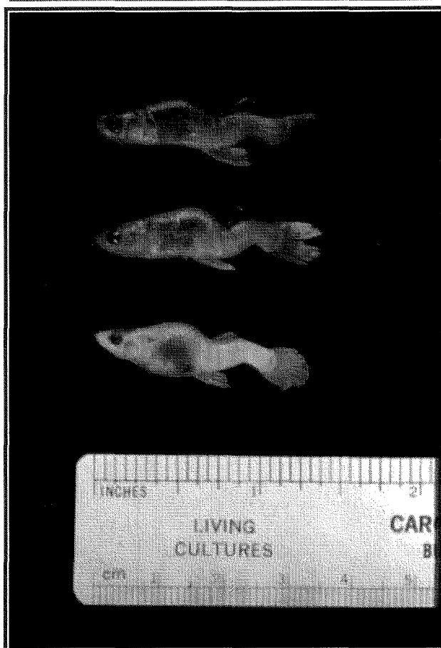
Figure 1. Toxic effects of coal combustion waste. Metals and trace elements leached from surface-impounded CCW have caused dramatic and costly impacts to aquatic life for decades. Effects range from acute mortality to chronic, debilitating toxicity as shown here in this 1980 photograph of fish from Belews Lake, NC, afflicted by selenium poisoning (v-shaped spines). Selenium bioaccumulates in food chains and passes from parents to offspring in eggs, where it causes a variety of skeletal deformities and other abnormalities in the developing embryos. This can lead to massive reproductive failure and local extinction of species.

caused a long-term, catastrophic toxic event at Belews Lake, NC, where selenium poisoning extirpated 19 species of fish from the 1560 ha reservoir (5, Figure 1). Belews Lake quickly became a landmark example of the ecological hazard of surface impounded CCW.