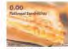
Off-board flat-bread gel

SPECIFICATIONS: (2) NON-ILLUM'D TOPPERS W/ TWO 15-LINE LIFT 'N DROP GRIDS EACH FOR CHANGEABLE 1" MENU STRIPS TO DISPLAY CALORIE COUNT OF ALL PRODUCT. ALL FONTS TO BE SAME SIZE AS FONTS USED ON PRICE GRIDS; CUSTOMER TO SUPPLY EXACT COPY WITH CALORIE COUNT TOPPER CABINETS TO BE 8" DEEP & SET BACK 1" FROM FRONT OF MENUBOARD; TOPPERS TO HAVE TOP-HINGED DOORS W/ CLEAR POLYCARBONATE WINDOW ALLOWING CHANGING OF STRIPS CABINETS & DOOR FRAMES PTD. SAME AS MAIN MENUBOARD