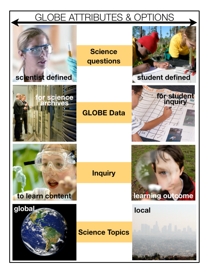
Figure 2. Examples of the range of options for GLOBE attributes that underpin inquiry-based learning. For example, science topics can either be globally or locally defined and data can be collected for scientific studies or for the benefit of student inquiry.