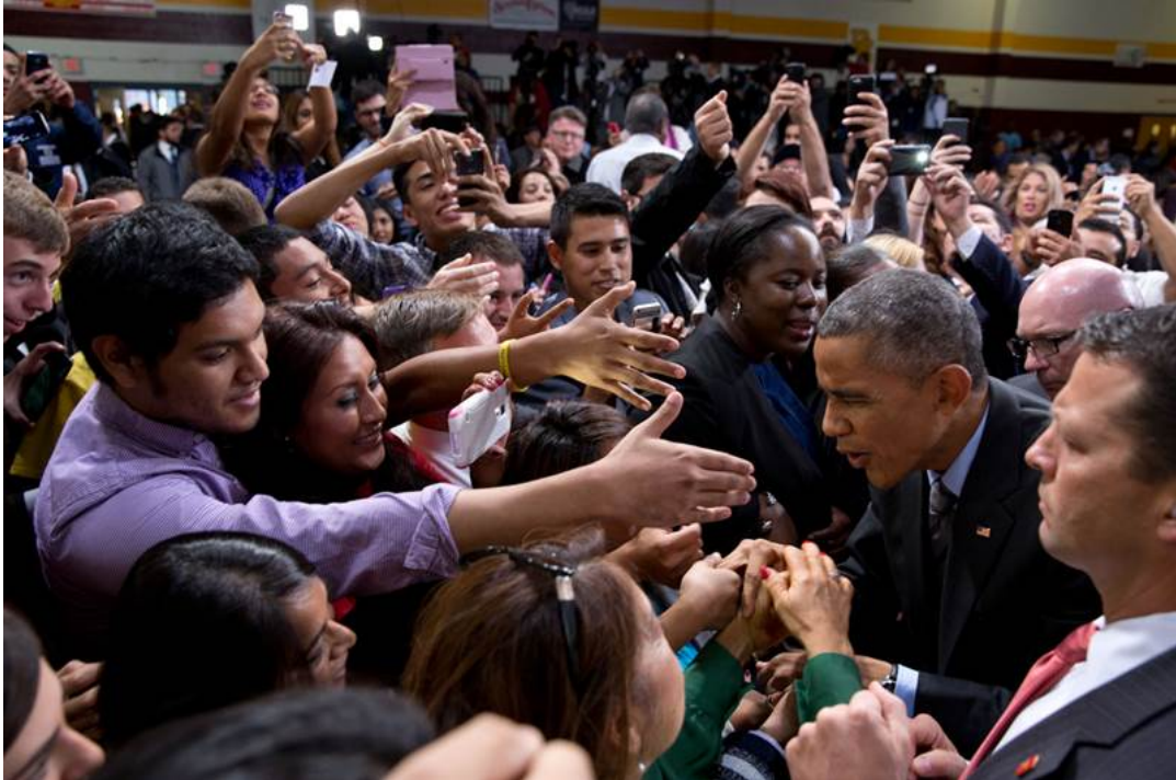
President Barack Obama greets audience members after making remarks on immigration at Del Sol High School in Las Vegas, Nev., Nov. 21, 2014.

Welcoming environments help ensure successful outcomes that benefit local communities as well as our nation. While there are steps that immigrants and refugees can take to better integrate, their new communities also have a role to play. Indeed, community strategy and action are just as important to new Americans' success and help foster their growth as they learn English, navigate the job market, and become civically engaged. Like any relationship, the one between immigrants and refugees and their new communities must be a two-way process with shared opportunities and responsibilities. A growing number of communities have recognized the potential benefits of pursuing a welcoming approach, including the more than 50 BWCC cities and counties.