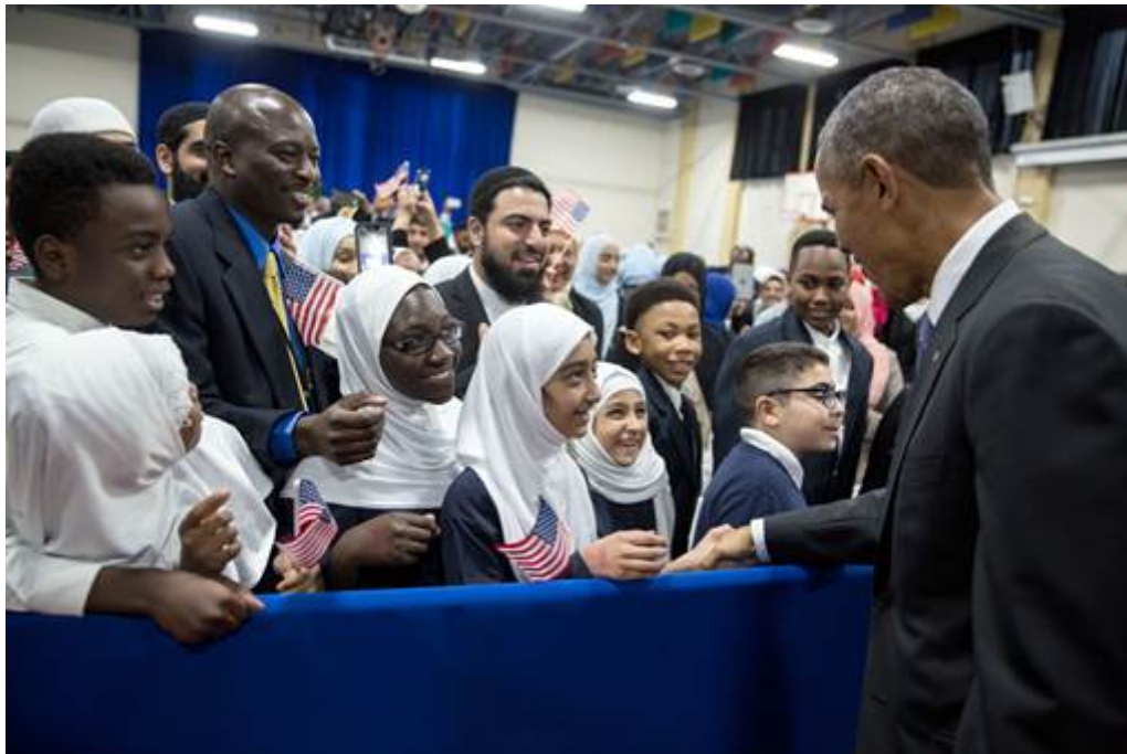
President Barack Obama greets students after he delivers remarks to students in the gymnasium at the Islamic Society of Baltimore mosque and Al-Rahmah School in Baltimore, Maryland, Feb. 3, 2016.

English-language acquisition is vitally important for new Americans to integrate successfully into their communities. Though some new Americans come to the United States fluent in English, many do not. Even those who are fluent in the English language may find their skills faltering in unfamiliar or intimidating situations, such as in courtroom proceedings, when receiving a health care diagnosis, or in contacts with local, state, or federal government. Understanding and communicating in English has a significant impact on the ability of an immigrant or refugee to find a job, advance in a career, and become civically active in his or her community. Therefore, one of the most effective ways to help immigrants and refugees integrate is to support their acquisition of English language skills while also valuing and recognizing the importance of strengthening and maintaining native language proficiency. Valuing both-language development is especially important in young children, as research indicates that supporting native language development has many benefits.